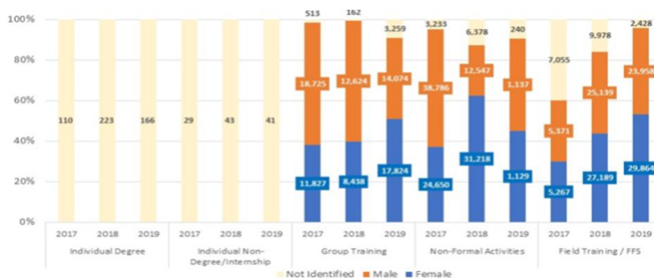
Figure 2 RTB capacity development activities by group type and gender, 2017–2019

It was noted that a major element of CapDev should be to enable national organizations to cooperate directly with ARIs and universities. The exchange of students facilitates long-lasting linkages, especially for students spending more than one year of study abroad. It was noted, however, that it is difficult to ensure that students return to national programs. While many of them return to their institution, some are soon promoted into management positions with mixed benefits for research while others stay abroad after their study.